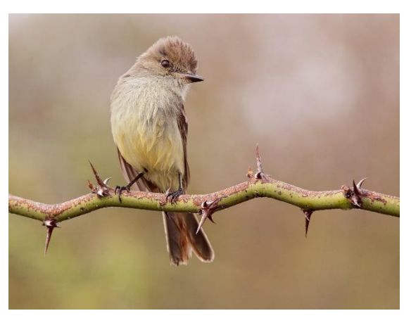
2016 winner: Galapagos flycatcher by Evangelina Indelicato

photograph in Galapagos - the stark beauty of the islands, the deep blue of the water and equatorial skies, and of course the unique wildlife, make it a photographer's dream. However, whilst it's difficult to take a bad photograph, it's doubly so to take a really outstanding one, an image that stands out amongst thousands of others. I really look forward to seeing the entries to this year's competition, and hope that they capture the essence of the Islands as previous competition winners have certainly done. Good luck to everyone - it is certainly one of my great pleasures to review the entries as they arrive. May the best picture win!"